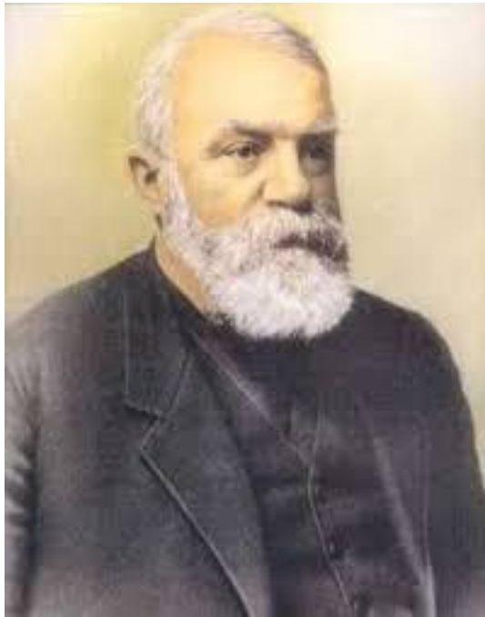
Dwight L. Moody